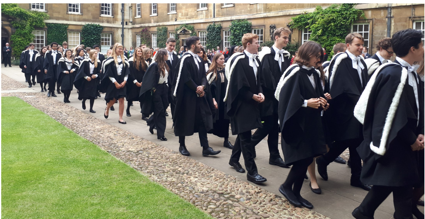
The correct Dress Options One and Two on display as graduands process to the Senate House