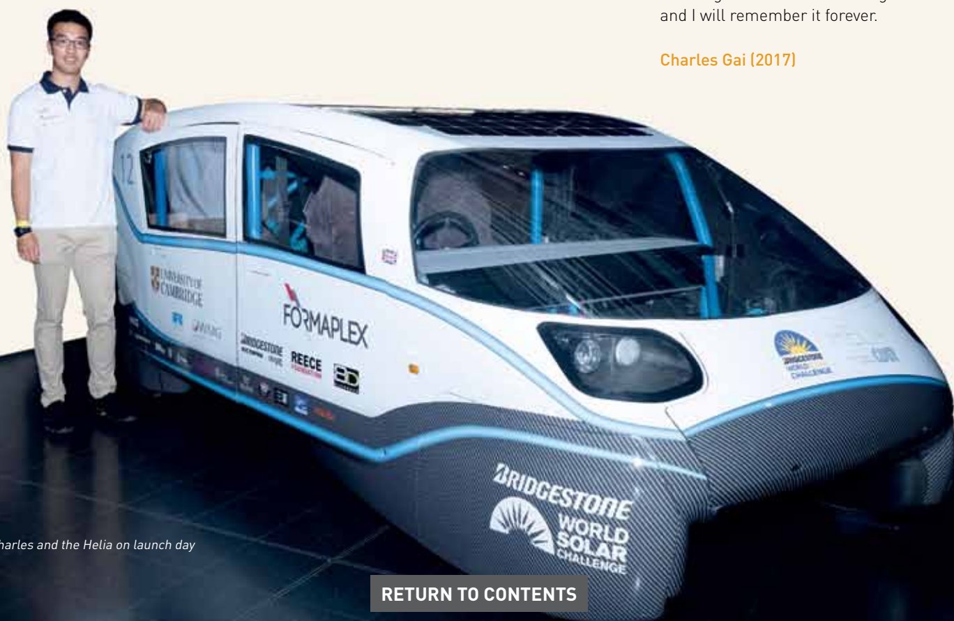
Charles and the Helia on launch day